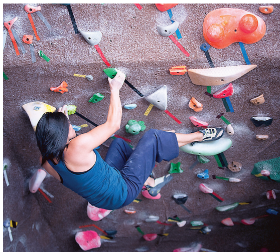
A student climbs the rock wall at the Student Recreation Center.