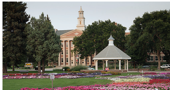
The PERC Trial Garden with the University Center for the Arts in the background.