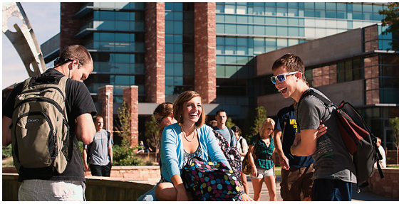
Students congregate at Newton's Corner in front of the Behavioral Sciences Building.